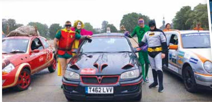
The "Diamond Geezers" drove their £300 car in the Monte Carlo or Bust rally!